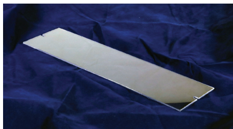
Pinch Guard/Syringe Window PN 1000013220