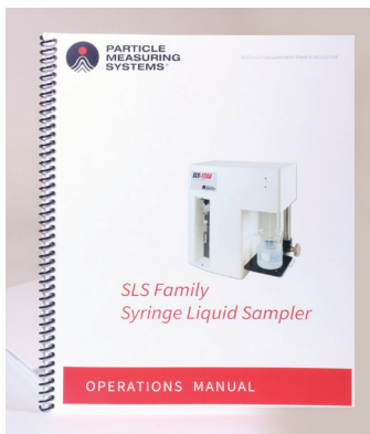
Operations Manual PN 1000014034