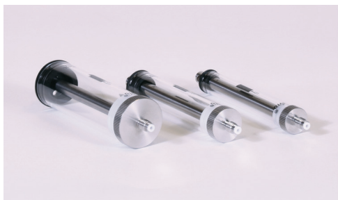
Syringes PN 1000011642 1 ml syringe PN 1000011638 5 ml syringe PN 1000011640 10 ml syringe PN 1000011636 25 ml syringe