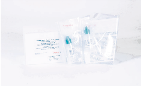
Calibration Kit PN 90154501