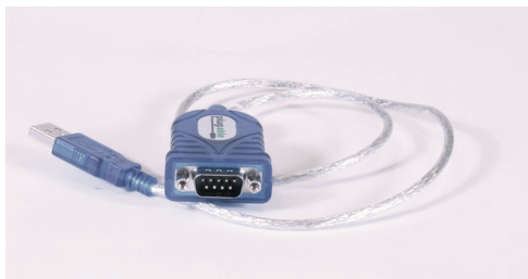
USB to RS-232 Converter PN 1000023262