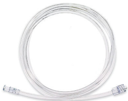
Extension tube, 20" PN 1000014060 10-pack, male/female Luer, PVC.