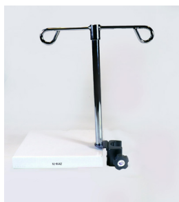
IV Bag Hanger Kit PN 90332050