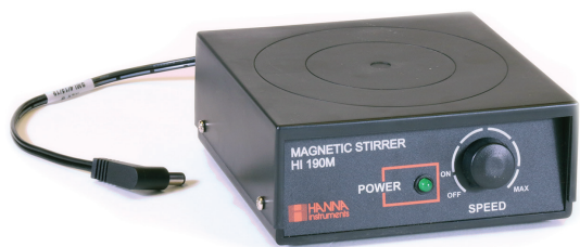
Magnetic Stirrer PN 1000014054