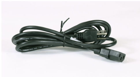
Power Cord CMP-CD02