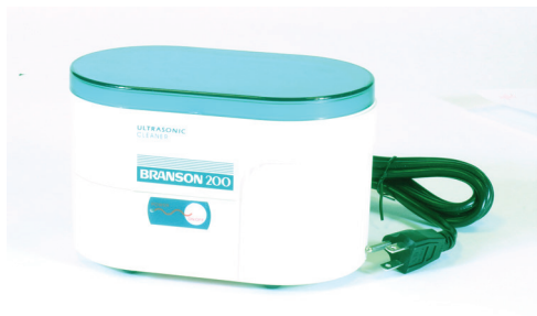
Ultrasonic Bath 120V PN 1000023800