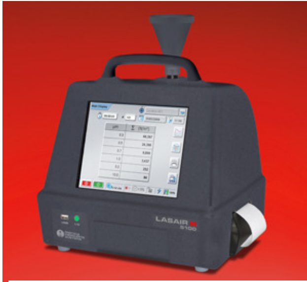
Lasair® III 1 CFM Particle Counter for 5 Micron Monitoring